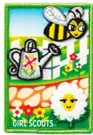
Welcome to the Daisy Flower Garden