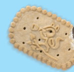
Girl Scout S'mores